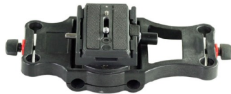
Camera Base with Quick Release